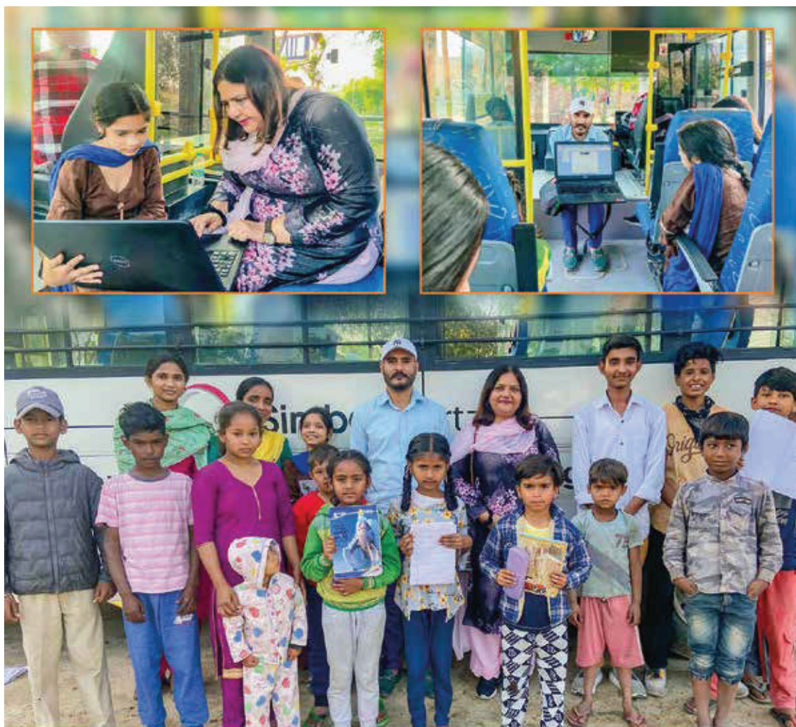
Under the Corporate Social Responsibility initiatives of SimbaQuartz

Our company has taken a unique initiative to impart computer training to the children living in the slums. In this we conduct computer classes for the children in our company's bus. In the month of March, under this initiative, our team provided computer classes to the children of Beas slums who go to school. Our endeavor and dream is to provide quality education facilities to the children of economically weaker families at our own level as these children deserve it. They too should grow up to be IT engineers and help their families get out of financial difficulties. Free education can prove better than any financial help. We shall continue to do this service regularly.